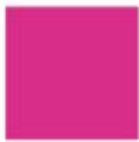
Existing Barcombe Playground