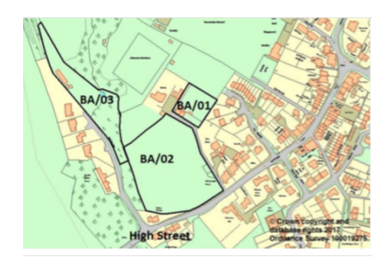
Map 3: Draft LDC Core Strategy Part 2 (Nov. 2017) Site Classification