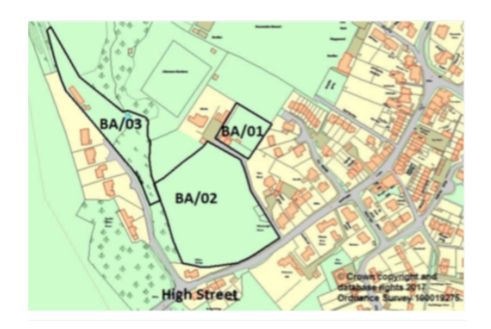
Map 3: Draft LDC Core Strategy Part 2 (Nov. 2017) Site Classification